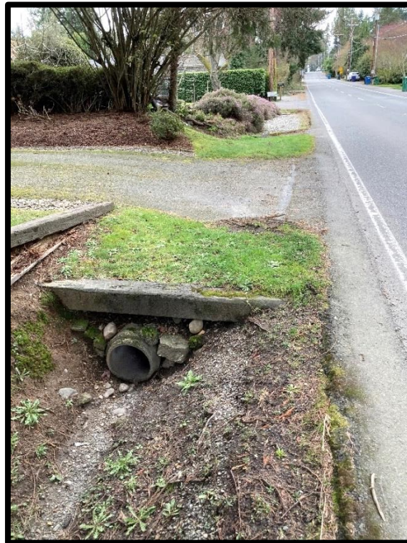
Element D: 8" concrete culvert along eastern side of 72 nd Avenue SE