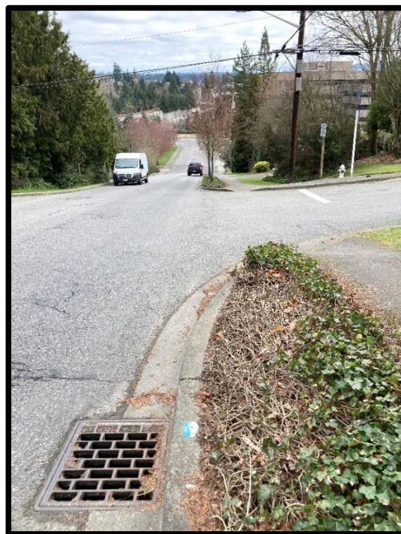
Element F: Type 1 CB at intersection of SE 24 th Street and 74 th Avenue SE