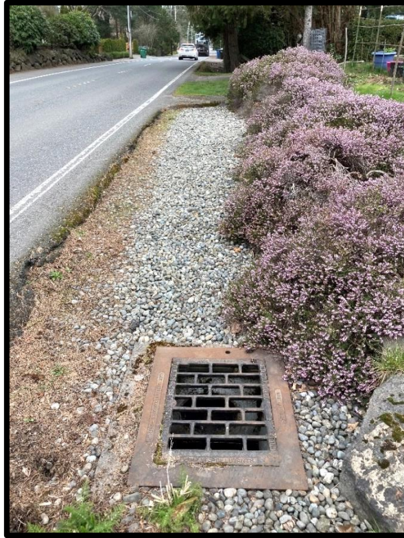
Element C: Type 1 CB along eastern side of 72 nd Avenue SE