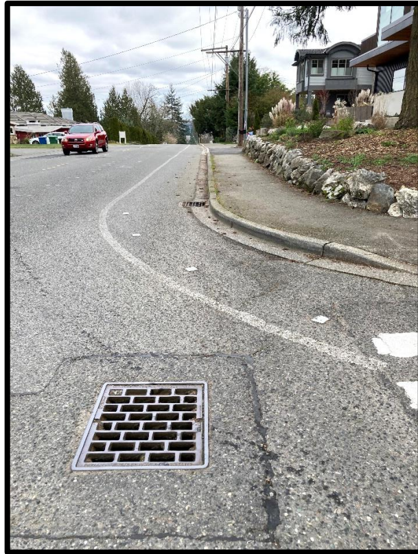
Element E: Type 2 CB at intersection of 72 nd Avenue SE and SE 24 th Street