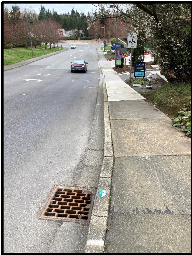
Element G: Type 1 CB at ¼ mile downstream limit