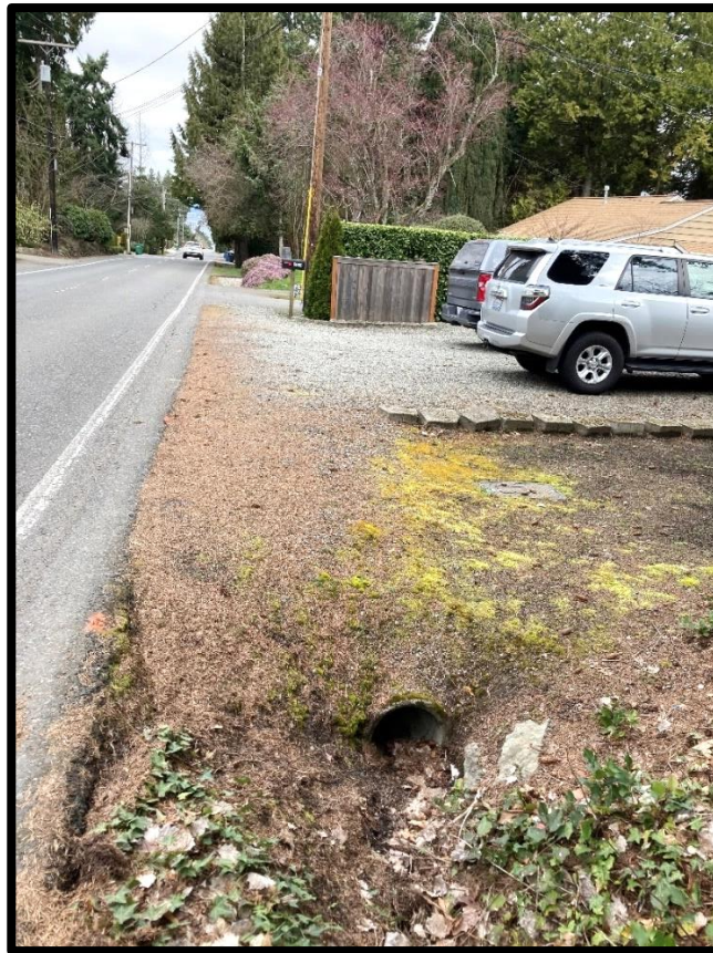
Element B: Stormwater ditch along eastern site frontage