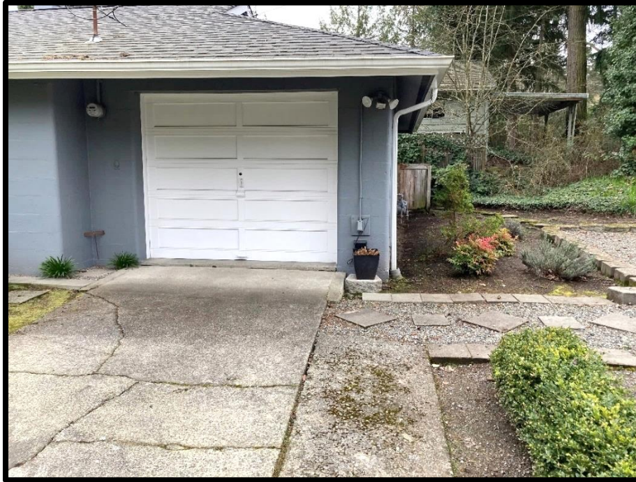
Element A: Downspouts connect to underground roof drain system